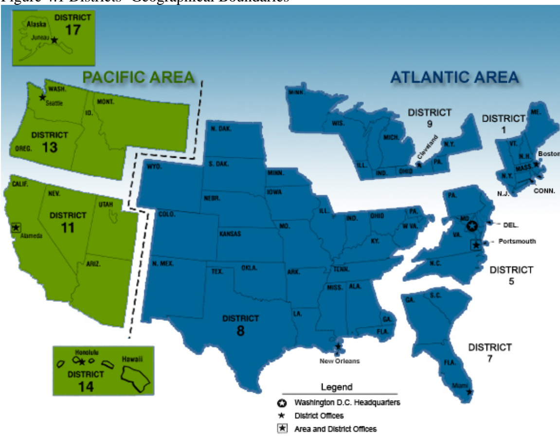
Figure 4.1 Districts' Geographical Boundaries